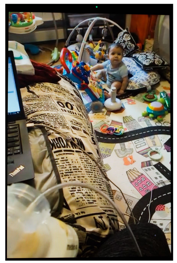
Fig. 13 Iris

For teleworking parents, being home was both a benefit and a burden depending on their professional and life circumstances. White-collar jobs with good salary and benefit protections afforded parents the financial ability to secure in-home childcare or at least the flexibility to work around their lactation schedule, rather than the other