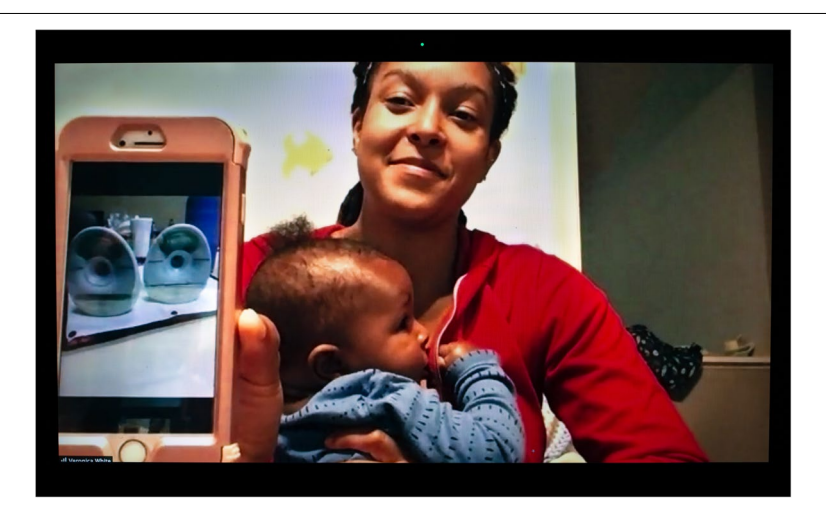
Fig. 5 Victoria

While caring for infants is extremely demanding physically, cognitively, and emotionally, social isolation creates different hardships for different people. The more privileged, who live in single-family homes or apartments, talked about the fatigue of being one-on-one with their children for extended periods of time, while the least resourced, sharing homes or rooms with multiple people, regretted the lack of privacy. For affluent parents, the crisis was an opportunity—or catalyst—for relocating from urban areas to the suburbs, the country side, or foreign countries. Sienna (Fig. 8), a White bar owner who had been "trying to figure out how to get our kids a backyard and have a little more space for a while," moved out of the large city where she resided when her bar was