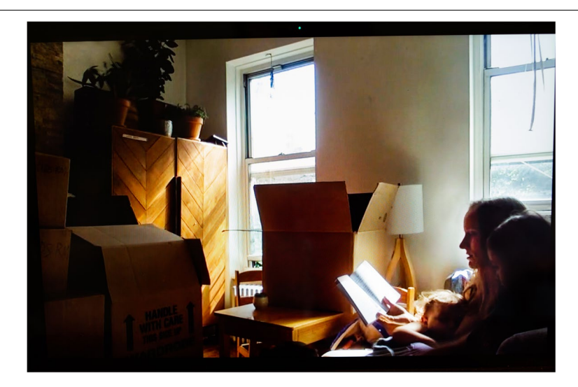
Fig. 8 Sienna