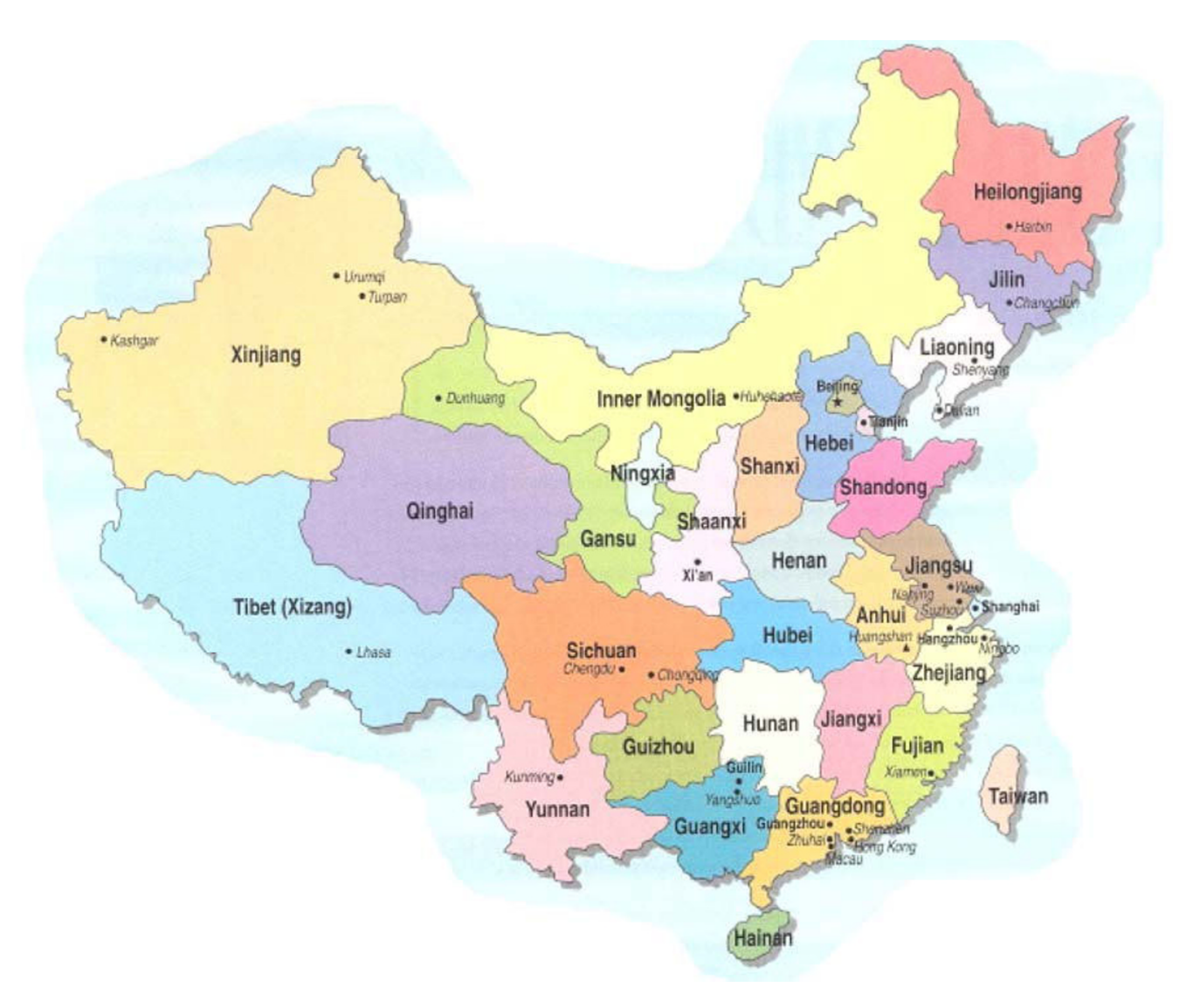
Figure I The provinces and the major cities of PR China.

1992) to 83% (in 1993 – 1994); and the 'full breastfeeding' rate increased from 28% before the initiation to 40% afterwards (the cross sectional study, n=439) [7]. Another survey in Beijing (retrospective study, n=817) showed the breastfeeding rate at four months was only 16.42% in 1989 – 1991; but it increased to 56.73% in 1995 – 1997 [23]. A survey at the Beijing Railway Hospital (retrospective study, n=824) showed the same trend: the breastfeeding rate at four months was 16.77% in 1991 – 1994 and 58.77% in 1995 – 1998 [24].