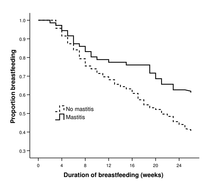
Figure 2 Duration of breastfeeding, by mastitis (n = 420).

However, as non-suppurative forms of mastitis were not identified, the real incidence of mastitis was likely to be higher. This and other earlier studies [8,12] probably underestimated the true incidence due to limitations in case ascertainment and the short time period that women were followed postpartum. For instance, earlier studies identified only those women with mastitis who sought medical treatment from the hospital where they were delivered and used hospital medical records as their source of data [8,12]. A more recent US study [3] reported a 9.5% incidence of health care provider-diagnosed lactational mastitis. In our study only one woman reported visiting a hospital casualty department with approximately one third of women visiting their GP. The majority of women either self-managed their mastitis or consulted only their community midwife and/or health visitor for management advice. In general, incidence rates for mastitis are below 10% when medical records and women seeking medical advice are used as a source of data, whereas incidence rates of around 20% are seen in studies where diagnosis is based on self-reported symptoms [1].