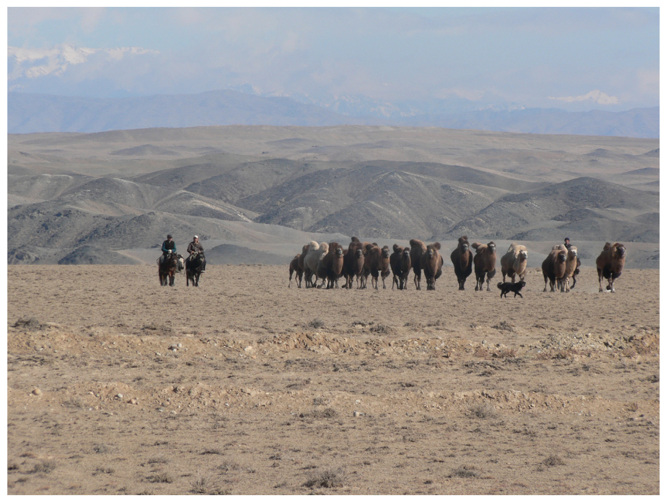
Figure I Khazak herdsmen, Xinjiang Uygur Autonomous Region.

ing rates in 2003–2004. Chi-square tests were used to compare the breastfeeding rates in the two periods of time.